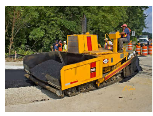
Hot mix asphalt (HMA) paver will place the new road surface.